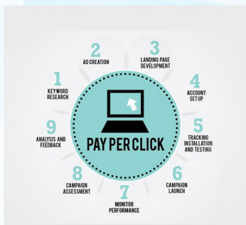
Pay Per Click